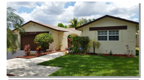
Gorgeous 4 Bedroom 2 Bathroom Available