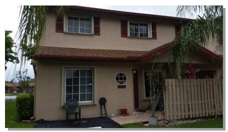
3 Bedroom 2.5 Bathroom Townhome 159.900 Available